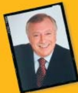
Michael Häupl, CEMR president since 2005