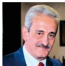
Hatzis Hatziefthimiou Mayor of Rhodes